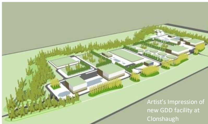
Artist's Impression of new GDD facility at Clonsaugh

Uisce Éireann wishes to advise you of An Bord Pleanála's upcoming statutory consultation on the Greater Dublin Drainage project (the GDD Project). The planning application for the GDD Project was remitted to An Bord Pleanála for reconsideration following an Order of the High Court dated 16 July 2021 (the Remittal Application).