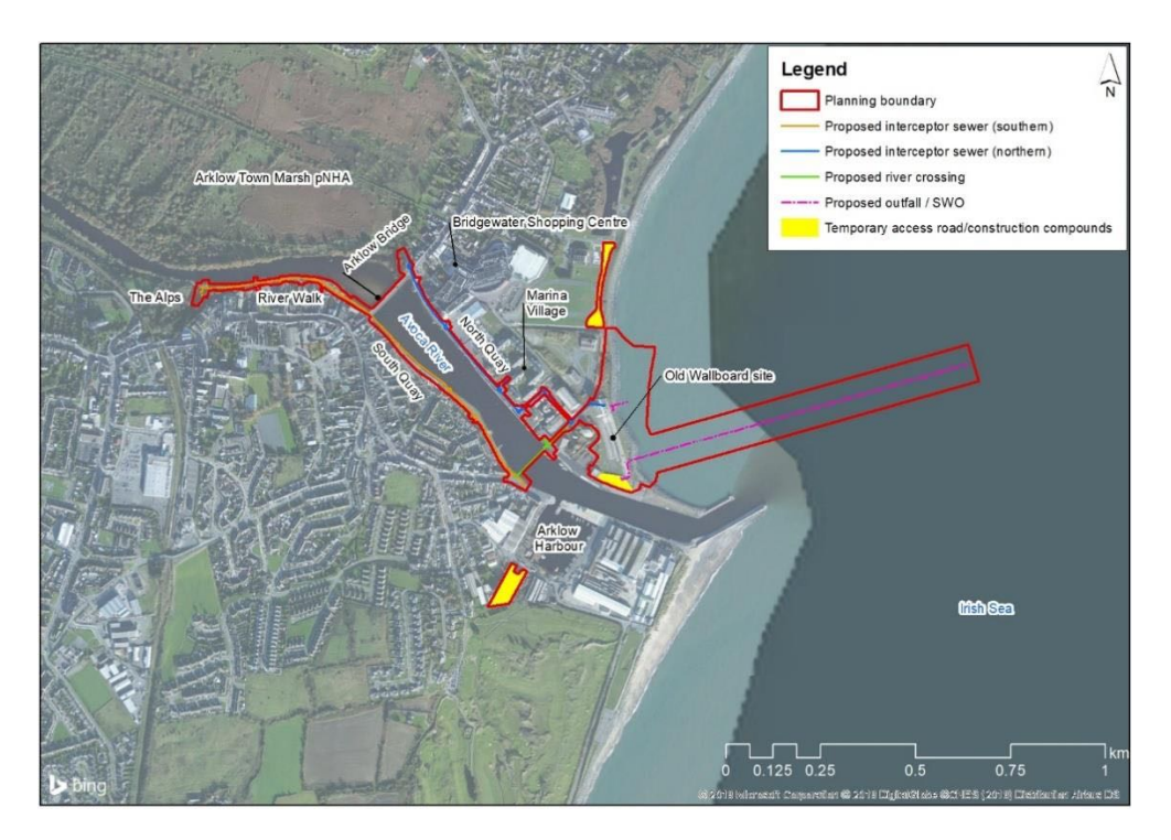
Figure 2.1: Site of the Proposed Development