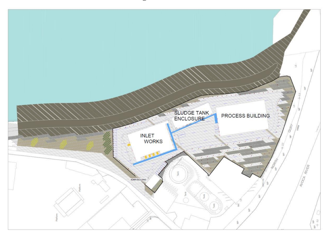
Figure 4.2: Proposed Wastewater Treatment Plant Site Layout at the Old Wallboard site

The Wastewater Treatment Plant will be located on the Old Wallboard Site at Ferrybank. Four stand-alone buildings are proposed as part of the Wastewater Treatment Plant, as illustrated in Figure 4.2 .