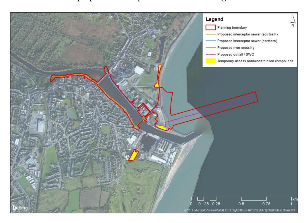
Figure 1.1: Location of the Proposed Development

The location of the proposed development is outlined in Figure 1.1 .