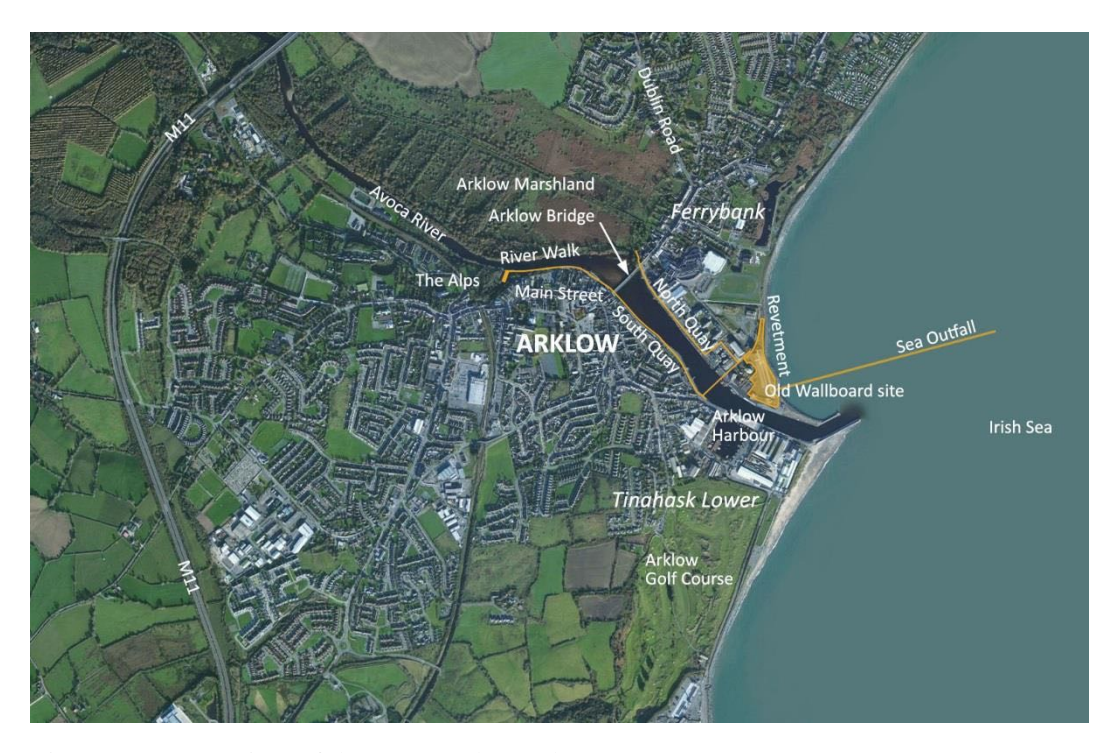
Figure 4.1: Overview of the Proposed Development